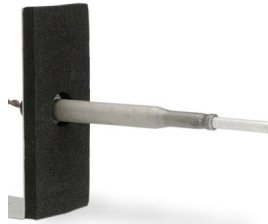
Rigid Probe – Bracket Mount